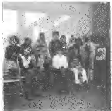
BONANZA CHURCH YOUNG PEOPLE

With some nine organizations using its facilities on a monthly basis, Bonanza United Church of Christ continues its excellent record of service to its community through service to God.